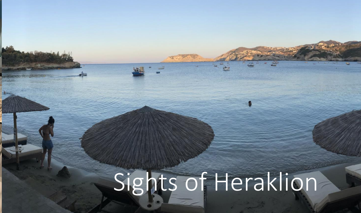
Sights of Heraklion